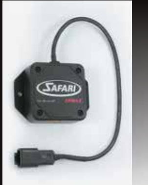
Thermocouple Signal Amplifier