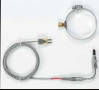
Industrial Grade Thermocouple